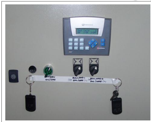
Electric Bollard Control Panel with Remote