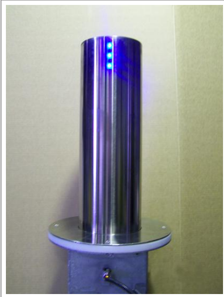
Electric Bollard in Stainless Steel